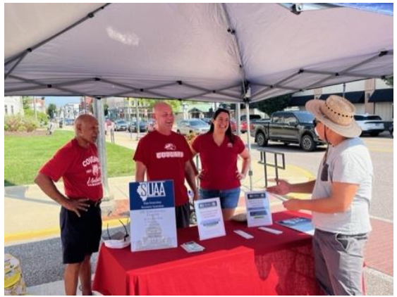
July 13<sup>th</sup> Information table at Goshen Market