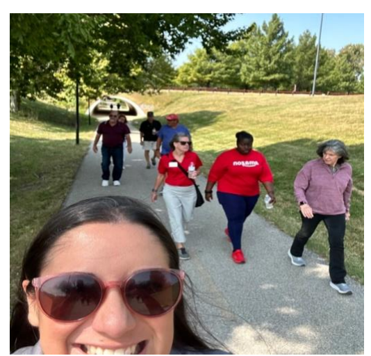
September 10th Walk & Talk