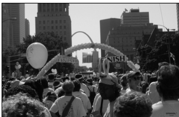
The finish line welcomed thousands of walkers!

On Saturday, June 10, 2006 over thirty Epsilon Eta members or members of their families joined 60,000+ walkers in downtown St. Louis to raise money for breast cancer research. This was the first time that many of the Epsilon Eta members participated in the Komen walk. It was thrilling to simply being part of the mass of thousands of other people who came to the same place for the same reason.