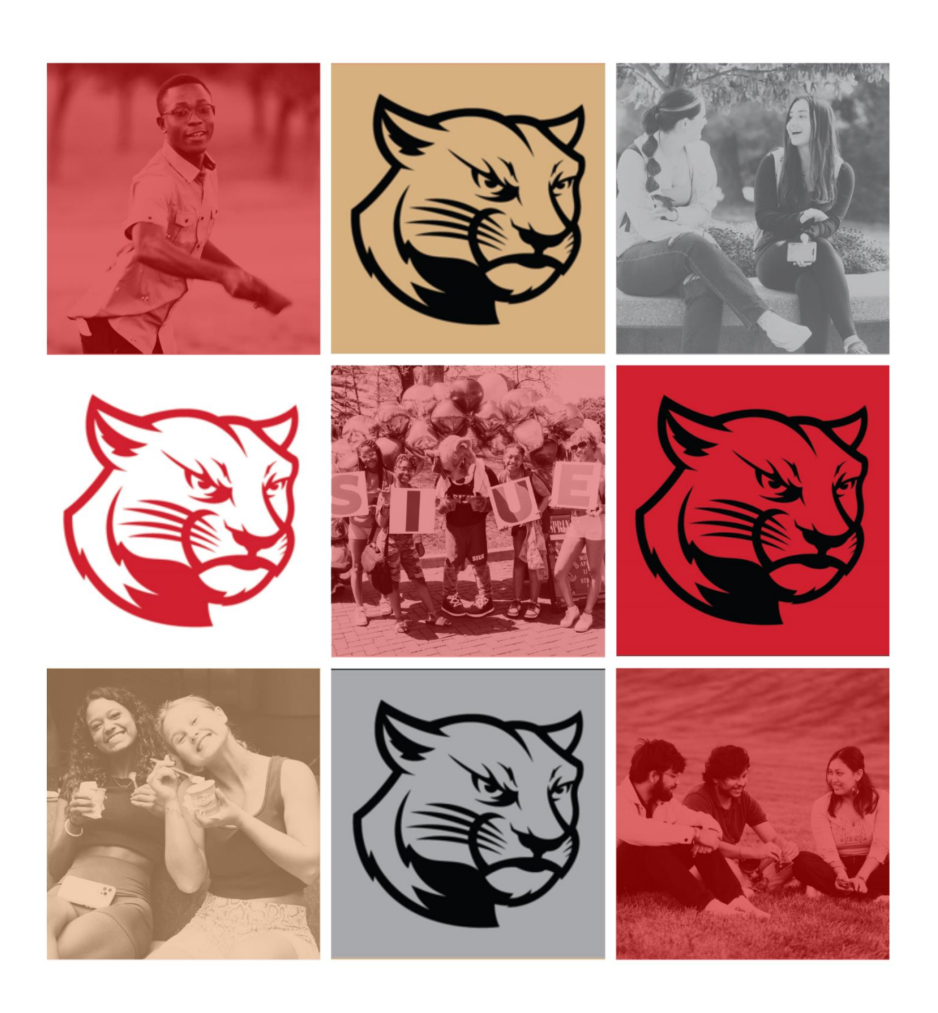
STUDENT ORGANIZATION MANUAL Kimmel Belonging and Engagement Hub 2024 – 2025

*This manual refers to policies that may be updated, organizations are expected to follow the most up to date policies. Links to the most up to date policies at time of update are provided.