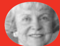
SIUE Foundation Inside Back Cover