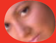
Scholarships and Awards