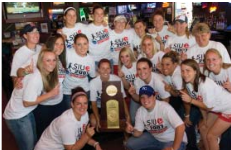
The SIUE softball team proudly displays their first ever national championship trophy.