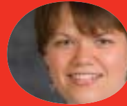
SIUE Alumni Association