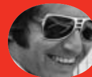
SIUE Love Connection