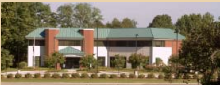
B. Barnard Birger Hall

The Heritage Society honors alumni and friends who include SIUE in their estate plans. These gifts for the future support scholarships, endowments, facilities, programs, and schools of the University.