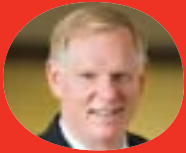
A Message from the Chancellor