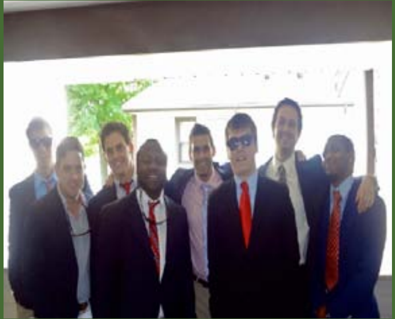
Illinois Eta Chapter at SIUE